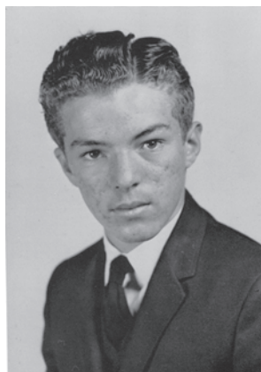
Thomas Fludd 1963