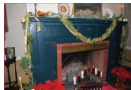
"At Christmas play and make good cheer, for Christmas comes but once a year." ~THOMAS TUSSEER