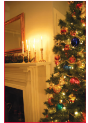
"Each home was more beautiful than the one before!"