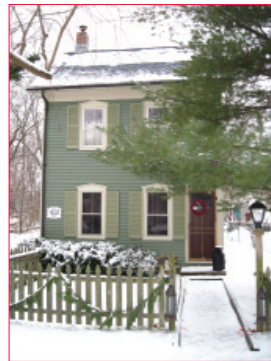
2011 Featured House: Jacob B. Souder, Sr. Tenant House, c. 1840.

Editor Note: My mom and I had the opportunity to attend last year's Historic Dennisville Christmas House Tour, visiting 11 charming homes that put us in the Christmas spirit. The full moon provided a well-lit path to each home where we were greeted by warm hosts and cozy fireplaces. The slight chill in the air reminded us that Christmas was coming! We are looking forward to it again in December. Maybe we will see you there!