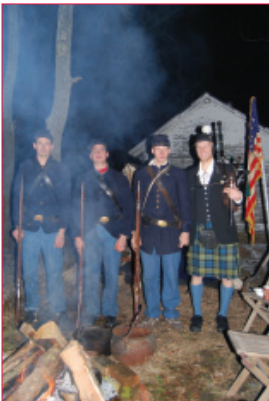
Reenactment of a Civil War soldier encampment outside the Rev. John Goff house