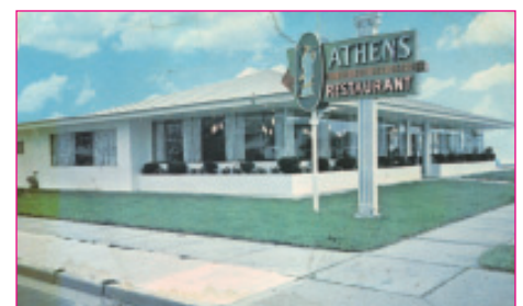
The Athens Restaurant which replaced Dr. Mace Hospital in the 1950s.