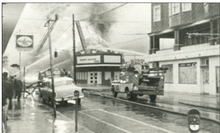
Fire at the Hurricane Club in 1964. Hurricane was located at 3800 Pacific Ave. (On the SW corner of Garfield & Pacific Aves.) The Ruthlynn Hotel is the building on the right which burnt down in 1981.

If you would like your Wildwood High or Wildwood Catholic High School yearbook photo featured in The Sun, please send us an email with your name, graduation year, & maiden name for girls. Include in Subject line: "Yearbook Photos" email: sun-by-the-sea@verizon.net