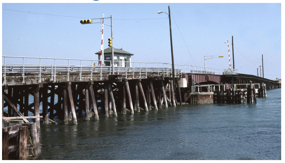
This old bridge was taken down in 1992 and replaced with a new and much higher one