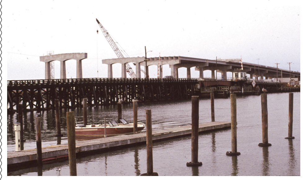
Road and bridge construction on North Wildwood Blvd. began in the late 1980s