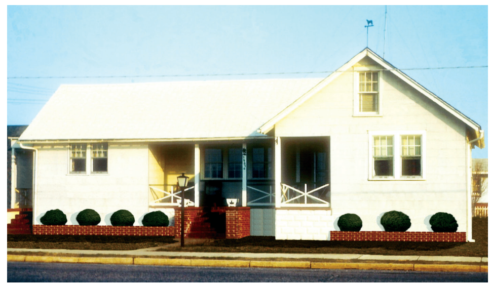
Our "Old Wildwood House" the way it looked when we first moved into it, in May of 1962.

Have you ever lived in a place that, no matter where else you might live afterwards, or how many times you move, that place always remains the place you think of when you think of "home"?