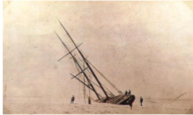
Wrecked Schooner off the coast of Anglesea in the late 1800s