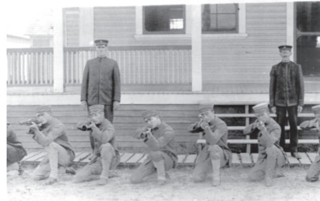
US Coast Guard, WWI