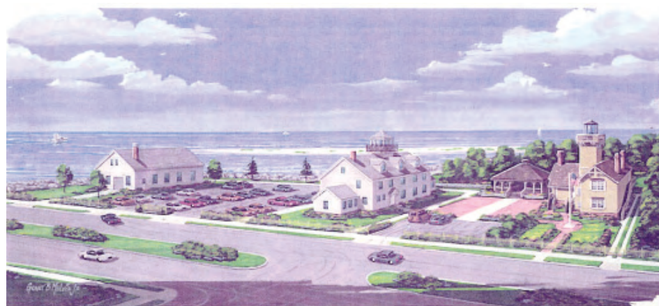
An artist's rendering of the proposed Anglesea Maritime Village

ods of life saving and walked lookout watches 24 hours a day.