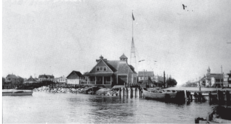
Hereford Inlet CG Station, near Hereford Inlet Lighthouse {Anglesea, North Wildwood}. The station was built in 1849 and was moved in 1882 because of the threatening ocean. In 1888, a new station was built. The building onsite today dates from the 1936-1940 period. The station closed in 1964.