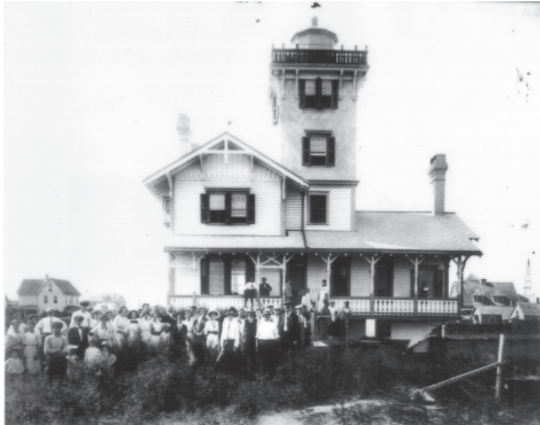
Local Anglesea residents in front of the Lighthouse after the storm of 1913