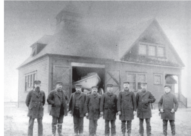
Hereford Inlet Lifesaving Crew in front of the station, 1890