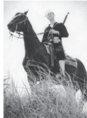
Mounted USCG Left~ WWI Above~ WWII