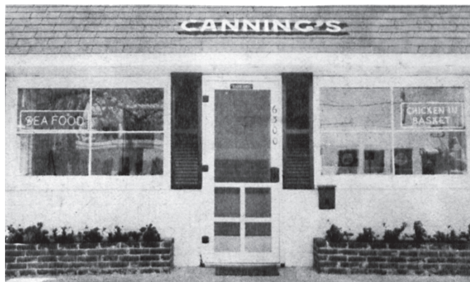
Canning's Take-Out Kitchen, 6300 N.J. Ave., Wildwood Crest in 1972