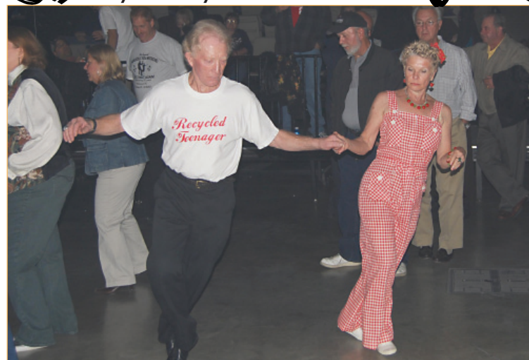
The concert was the centerpiece of a weekend celebration of the 1950s and Wildwood's rock and roll heritage, but on Friday night, the weekend jump starts with the Fabulous '50s Record Hop featuring "The Geator with the Heater" Jerry Blavat spinning classic oldies from back in the day and a night of fabulous dancing.