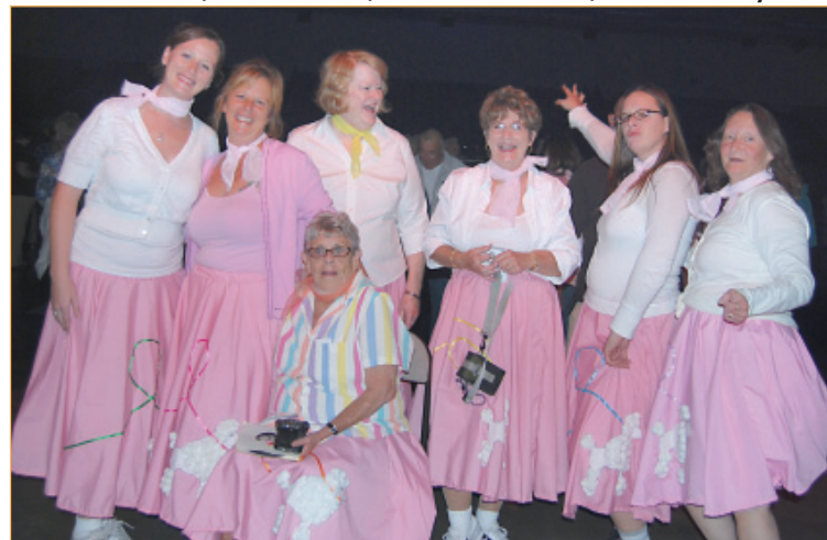
Dancers come to The Hop dressed in style. These girls (3 generations) came from near and far with their handmade poodle skirts and saddle shoes.