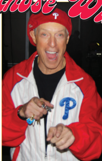
Legendary DJ JERRY BLAVAT , the Geator with the Heater, the Boss with the Hot Sauce kicked off the Fabulous 50s Weekend @ The Hop!