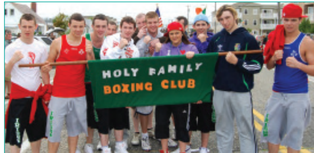
19th Annual Irish Fall Festival 2010~ The Belfast, Ireland boxers made their final appearance in the parade before heading back to their homeland.