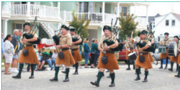
Many Bagpiper groups attended the Irish weekend festivities