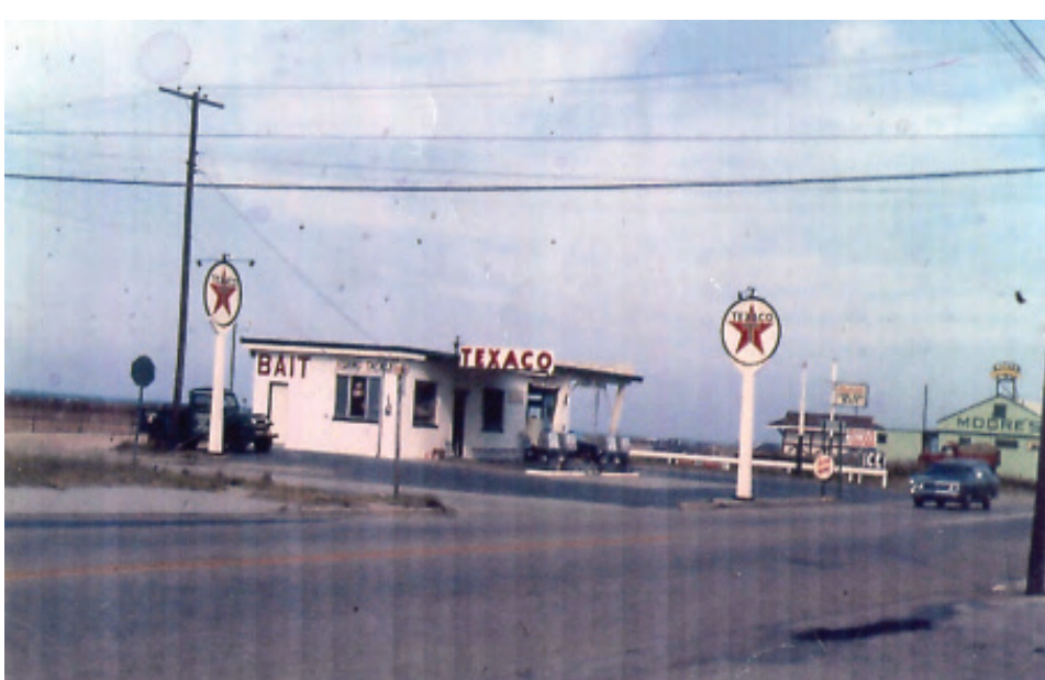
Moore's Inlet circa 1960s.