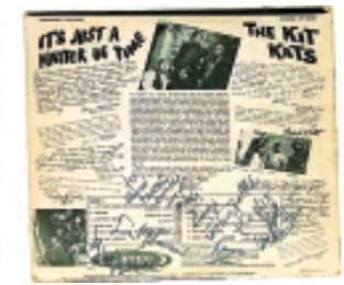
the original signed album