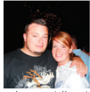
works, accompanied by patriotic music, was a perfect setting for celebrating our country's independence.