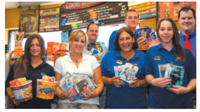
July 31st ~ Another rainy summer night sent droves of vacationers flocking to Wildwood's only Blockbuster for the best family home entertainment on the island.