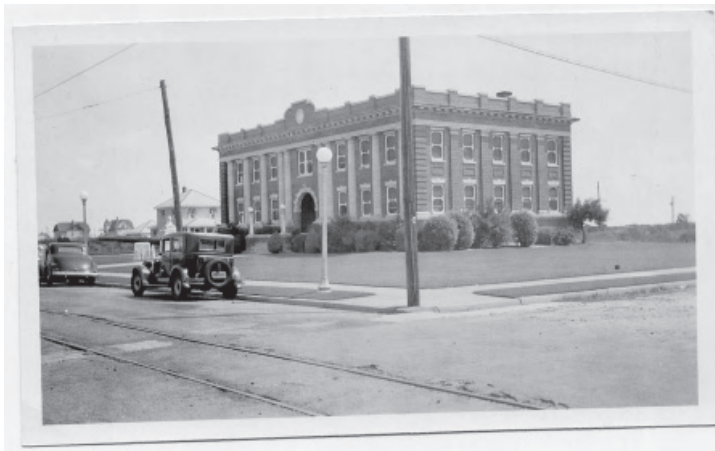
Left: The completion of North Wildwood City Hall a few years later looking northeast.

Council meetings will be held in the new annex with old council rooms being converted into new office space.