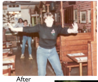
Hurricane Gloria in 1988 the rugs were taken out and the dining room becme a rollerskating rink!