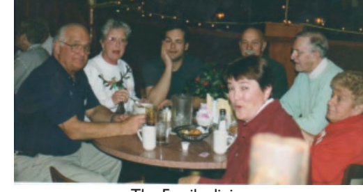
The Family dining