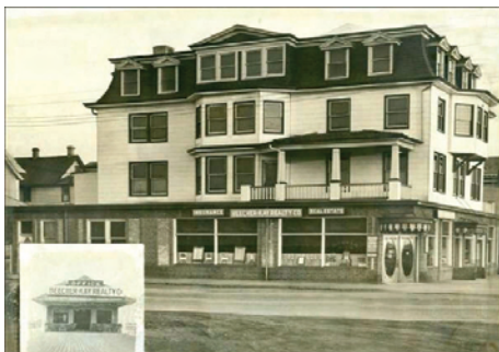
Beecher-Kay Realty Co. - 101 East Wildwood Avenue, Wildwood, NJ - Circa 1940s Beecher-Kay is the oldest continuing business in Wildwood with over 100 years of history. The inset photo was taken in 1907 at an unknown location. The building was also known as the Hotel Fenwick. The first floor of the hotel served as Wildwood's first post office.