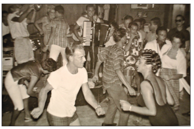
A typical sscene at Moore's Inlet Bar

Now, the couple that started with a kiss and a song is celebrating their fiftieth year of marriage and are retired living in Wildwood Crest, following their dream, a year round home by the shore. There they get frequent visits from their family, including their three grandchildren, allowing them to share their love and memories of the shore with a younger generation.